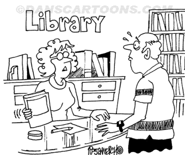
“Sorry, I can’t tell you where the religious section is because I’m an atheist.”