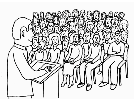
CHURCH MEETINGS ARE BRILLIANT